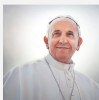
Pope Francis January 9, 2022

We belong to Christ, we are joined to Him through Baptism; His presence is in us, His light is in us, His life is in us.